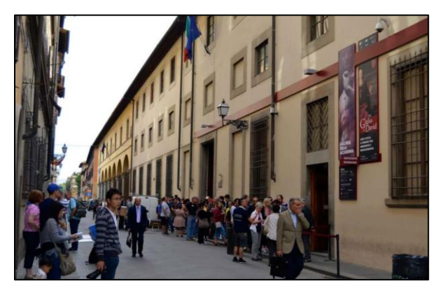
The excitement to see and experience the talented hands of Michelangelo is felt even before you enter the doors of the museum. There are pictures of the statue and artisan re-creations on the street and plaza nearby. In fact, the buzz created outside renders any marketing efforts by the museum almost obsolete. Once through the doors you are consumed with such anticipation of seeing David that you run the risk of missing the other great pieces of art the museum offers.

One of the greatest masterpieces by the Renaissance artist Michelangelo is the sculpture of David as a young teen before slaying the giant Goliath. This era defining work can be found in Florence, Italy at the Accademia Gallery Museum.