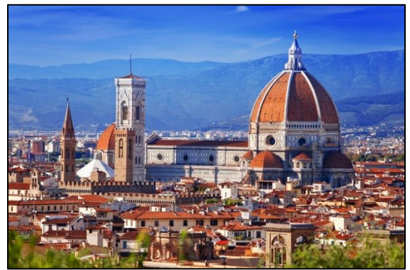
Santa Maria del Fiore, Florence Italy. The center of the city

However, 2020 happened. We saw, and are still experiencing, a global pandemic. A virus that attacks our most vulnerable without regard. Consequences